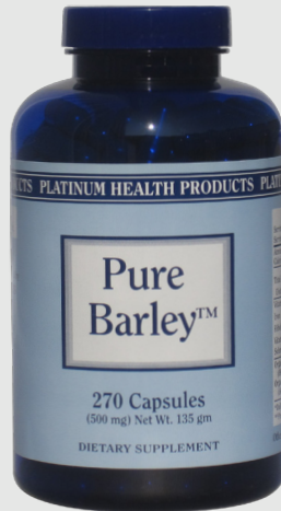
Pure Barley™ 270 Capsules Item Code: 2442