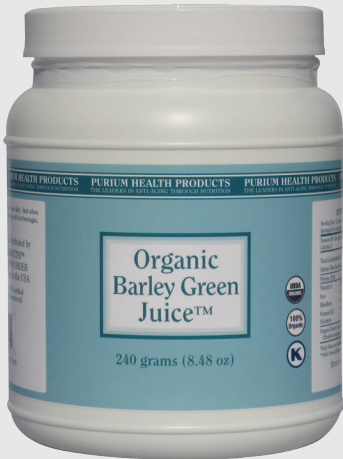
Organic Barley Green Juice™ 240 g Powder (8.48 oz) Item Code: 2440